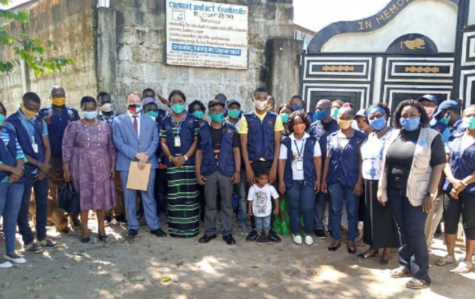
Our wonderful staff in the girls shelter in Bo with the German Ambassador in October 2020